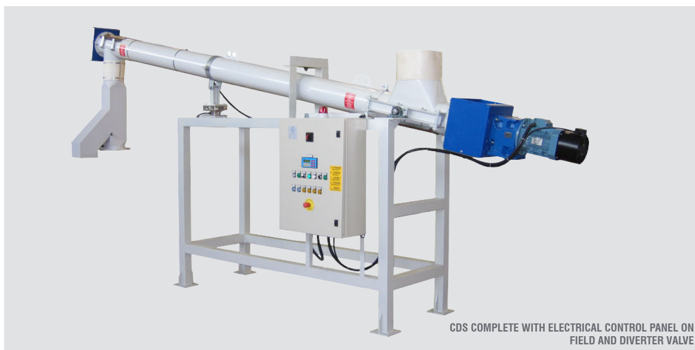
CDS COMPLETE WITH ELECTRICAL CONTROL PANEL ON FIELD AND DIVERTER VALVE