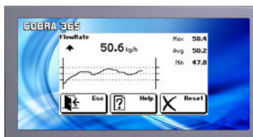
COBRA 365 ELECTRONIC CONTROL UNIT